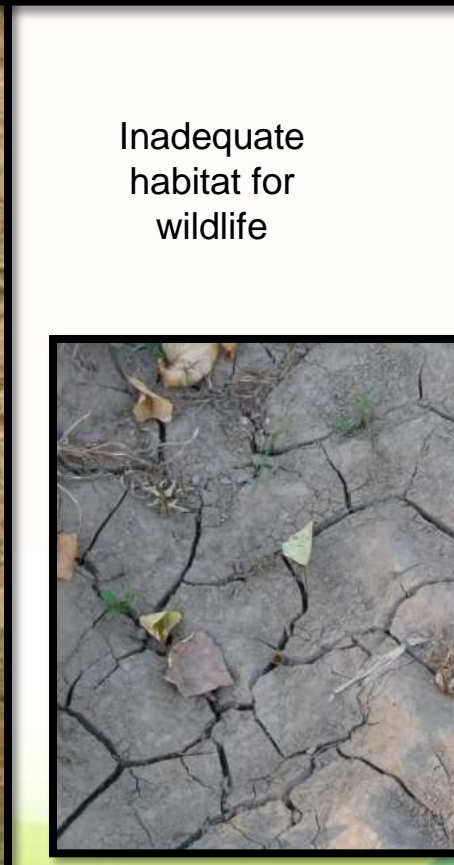
Inadequate habitat for wildlife