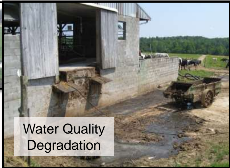
Water Quality Degradation