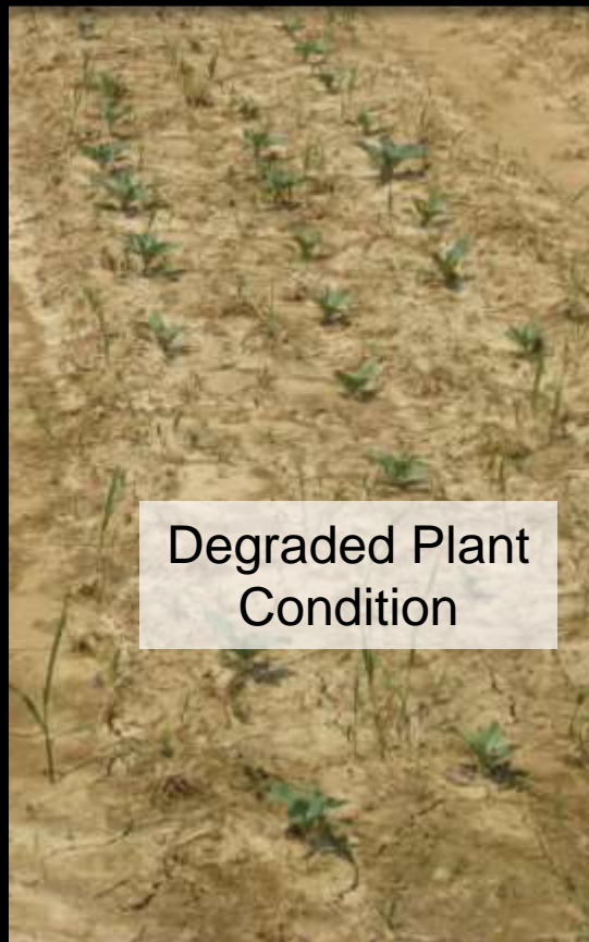
Degraded Plant Condition